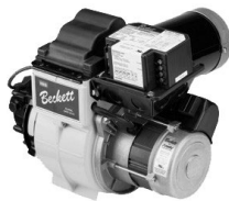
Burner motor: 3450 RPM, 120V / 60Hz / 1PH